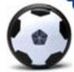
Tippy Bumper Soccer