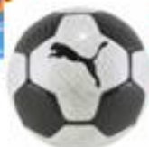
Puma Prestige Soccerball