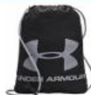
Under Armour Sling Backpack