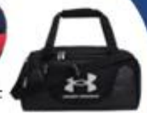
Under Armour Sports Bag