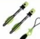
Verao Whistling Rockets