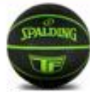
Spalding Mini Basketball

Raise $100-$199.99 Choose ONE of the following