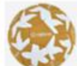
Verao Mini Beach Soccerball