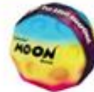
Waboba Moon Ball