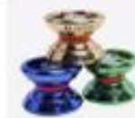
Verao Colourful Yoyo