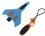
Verao Glider Plane

Raise $200-$299.99 Choose ONE of the following