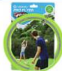
Verao Pro Flyer Frisbee