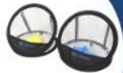
Verao Mini Net Toss Set