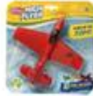
Wahu High Flyer